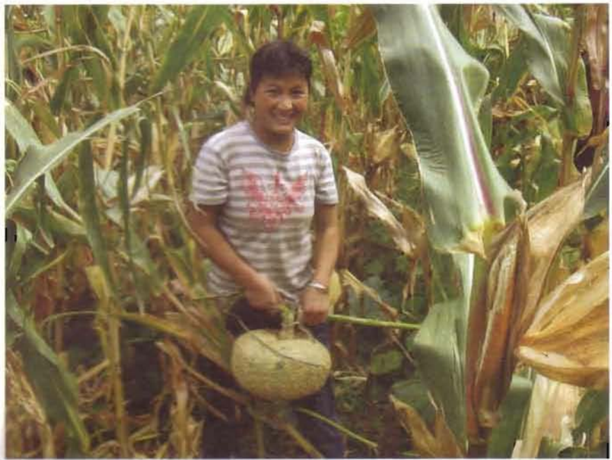
Interseeding is a common production practice.

We all face our unique challenges, but the fundamentals of farming are still the same whether we are in Tibet, in Wisconsin or wherever you are.