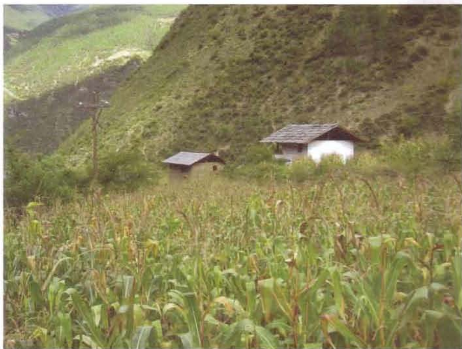
Steep, rugged hillsides are among the many challenges of crop production in Tibet.