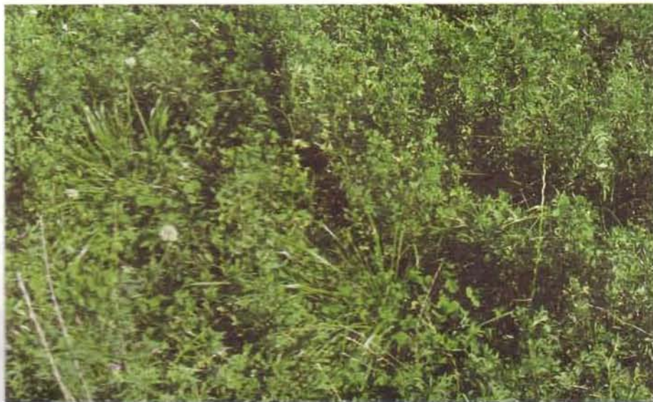
A mixture of grasses and alfalfa make excellent forages on the Roth-Mundt farm.

MBA's forage genetics that fit their farming operation including WinterKingII alfalfa, MBA HQF silage corns, and MBA's pasture blends (they like the energy that grasses bring to the forage mixture). And as part of preserving their quality feeds, they utilize Fermentation Plus inoculants on their forages.