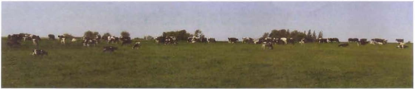
Summer finds the dairy herd grazing on new pastures.